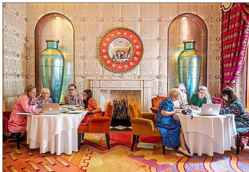
We'll be the judges: the expert panel choosing the winners of the first Evening Standard Home Design Awards at Michelin-star Sketch London restaurant in Conduit Street, W1