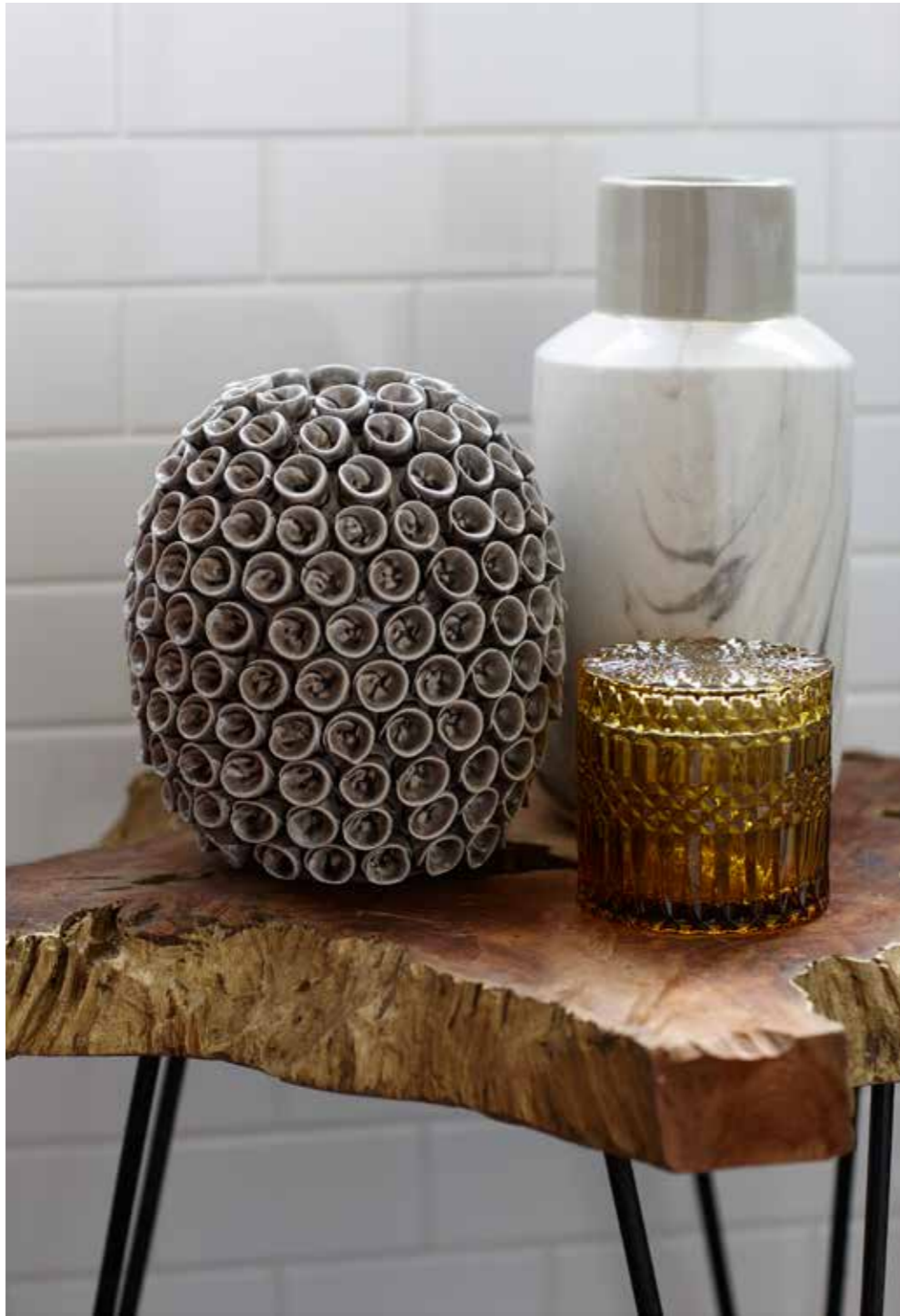
The main bathroom is kept light and airy with large marble tiles making a very subtle statement, while small accessories add an interest and elegant feel.