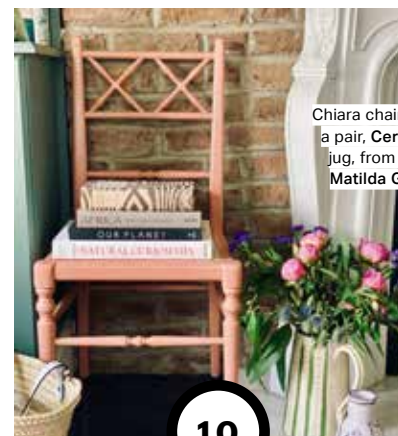
Chiara chair, £490 a pair, Ceraudo; jug, from £80, Matilda Goad