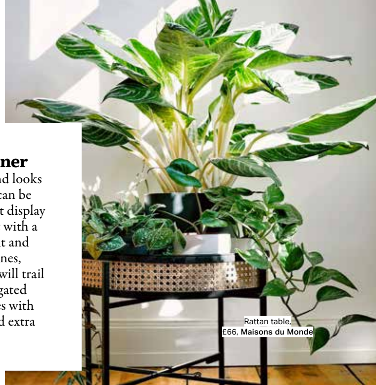
Rattan table, £66, Maisons du Monde

Rattan is on-trend and looks great with plants, as can be seen in this chic plant display by @green.pau. Start with a larger plant for height and then add in smaller ones, including those that will trail over the edges. Variegated plants that have leaves with patches or streaks add extra visual interest.