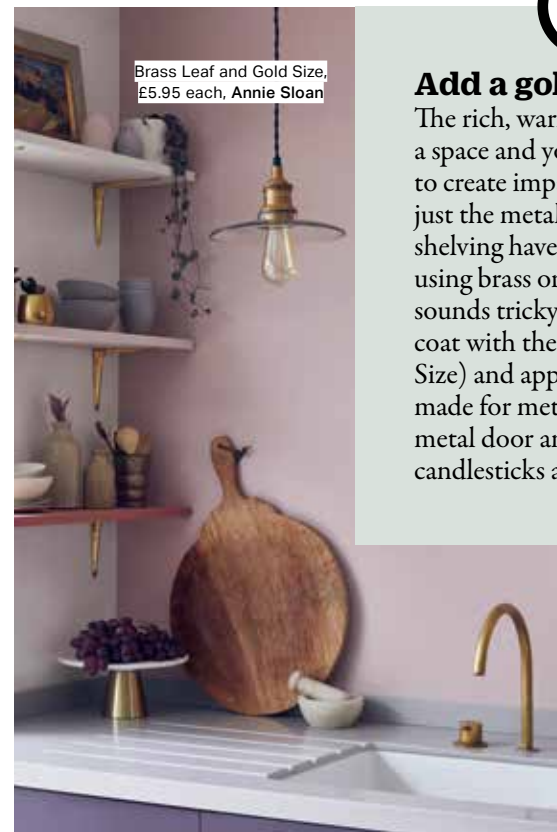
Brass Leaf and Gold Size, £5.95 each, Annie Sloan

The rich, warm glow of gold lifts a space and you don't need a lot to create impact. In this kitchen, just the metal brackets of the shelving have been turned gold using brass or gold leaf, which sounds tricky but isn't – simply coat with the special glue (Gold Size) and apply the leaf, which is made for metal. Use it to revamp metal door and drawer handles, candlesticks and picture frames.