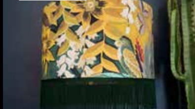
Velvet lampshade, from £55, Love Frankie

A statement light makes a room feel special but now you don't need an electrician to make a difference. The trend for easy-fit lampshades has seen an increase in stylish designs, so now it takes just minutes to revamp a room.